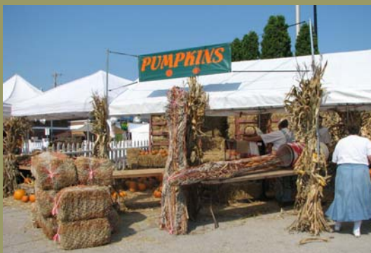
Outdoors at Harvest Fair

The attendance at the 2008 fair was estimated at over 60,000 for the three day event!