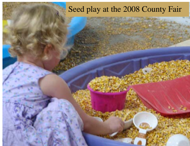
Seed play at the 2008 County Fair