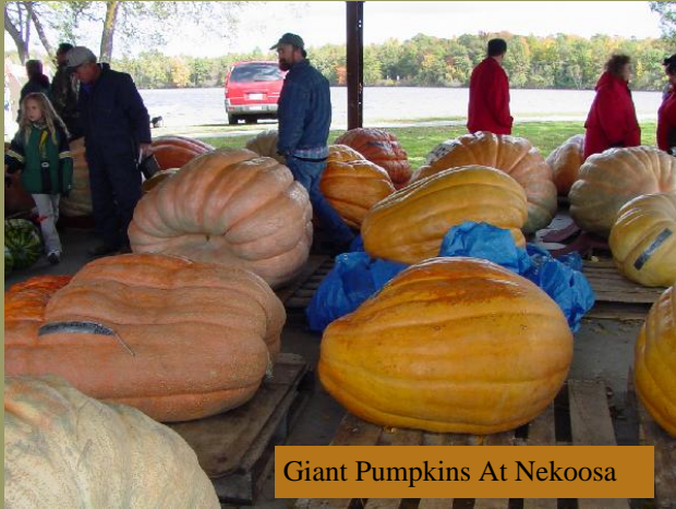
Giant Pumpkins At Nekoosa

The biggest Giant Pumpkin will be displayed in the Horticulture Pavilion. Who would not want to see for the first time in Milwaukee pumpkins that weigh over 1,000 pounds. ...And the biggest will be displayed near your booth.