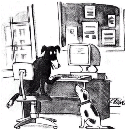
"On the Internet, nobody knows you're a dog."